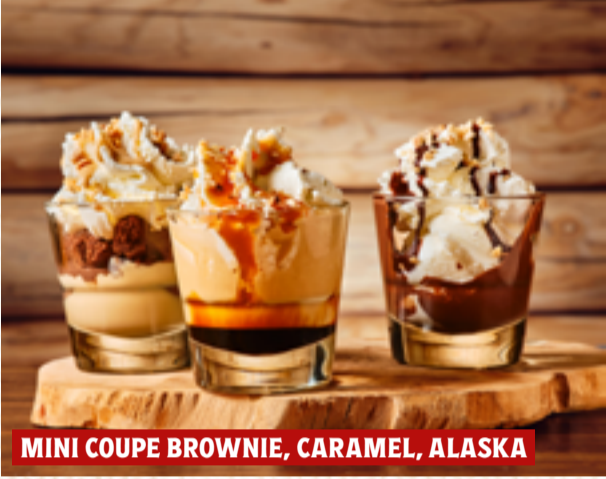
MINI COUPE BROWNIE, CARAMEL, ALASKA