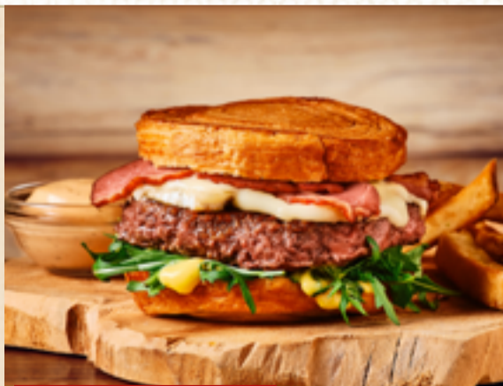
VERY FRENCHY BURGER