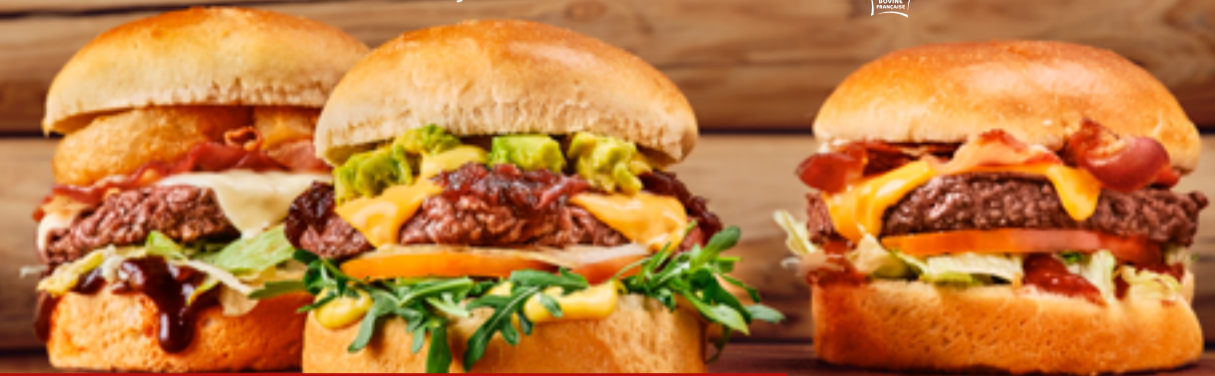
CHEESE & BBQ BURGER, CALIFORNIA BURGER, AMERICAN BURGER