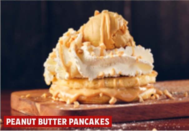
PEANUT BUTTER PANCAKES

PANCAKES BANANE NUTELLA 7.20 Pancakes*, Nutella®, banana, hazelnut slivers, peanut topping, whipped cream