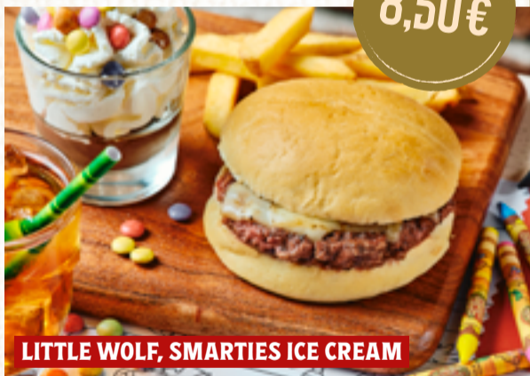
LITTLE WOLF, SMARTIES ICE CREAM

CHOICE OF BEVERAGE Water or Diabolo (30cl), Tropico Orange Pineapple Juice (20cl) or Tropical (20cl), Vittel (33cl)