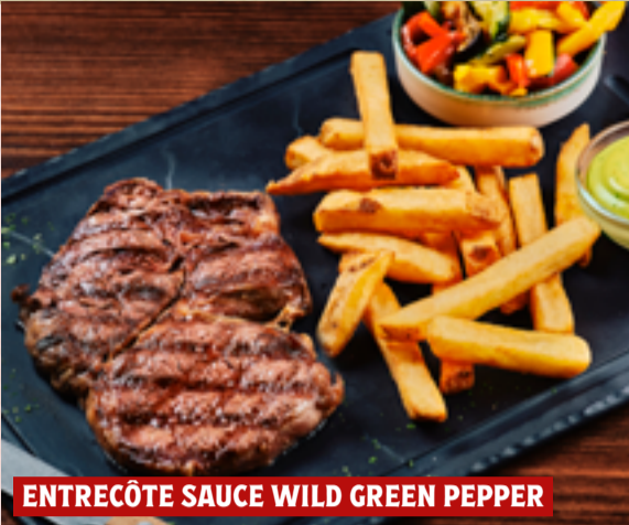
ENTRECÔTE SAUCE WILD GREEN PEPPER