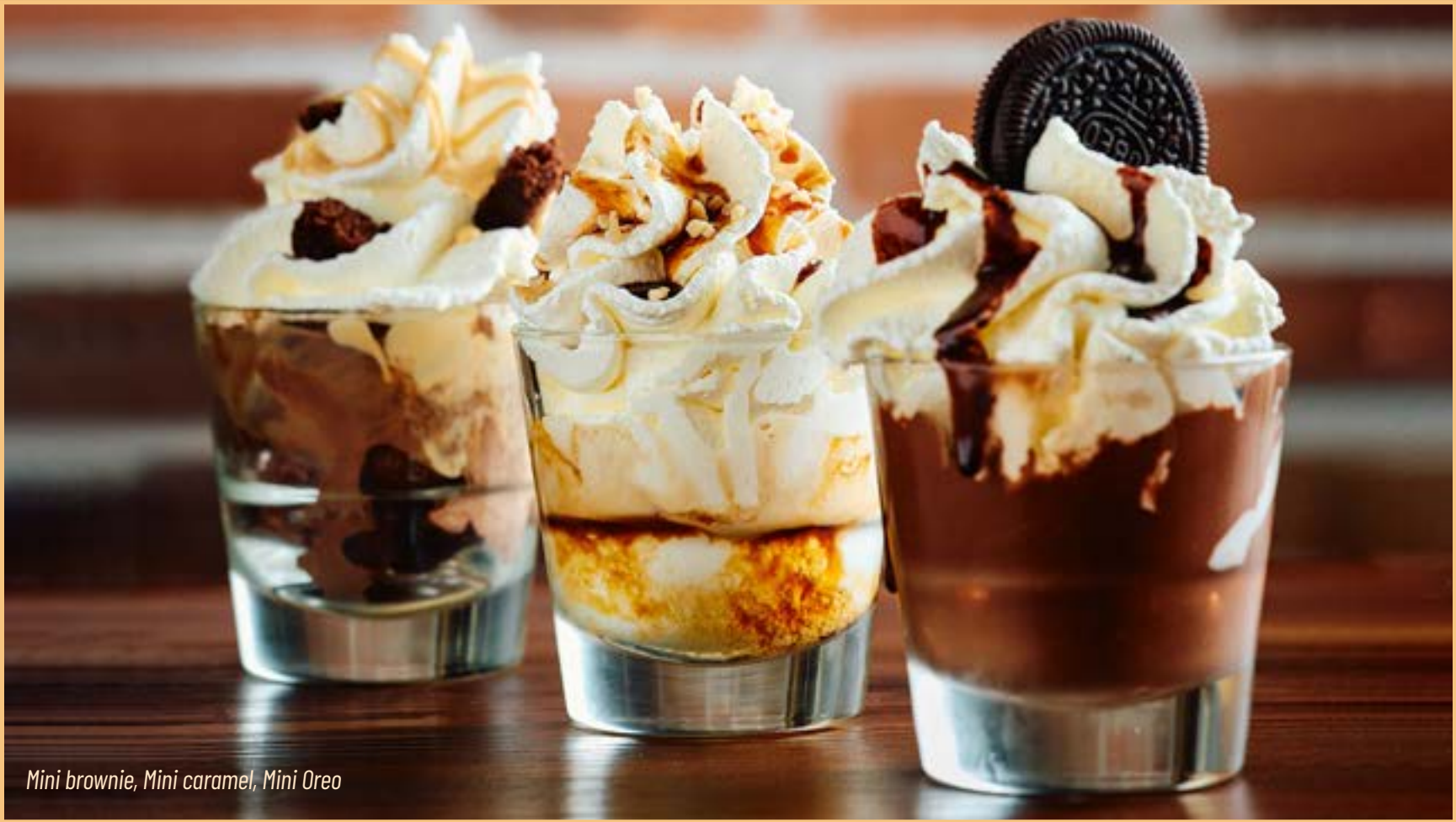
Mini brownie, Mini caramel, Mini Oreo