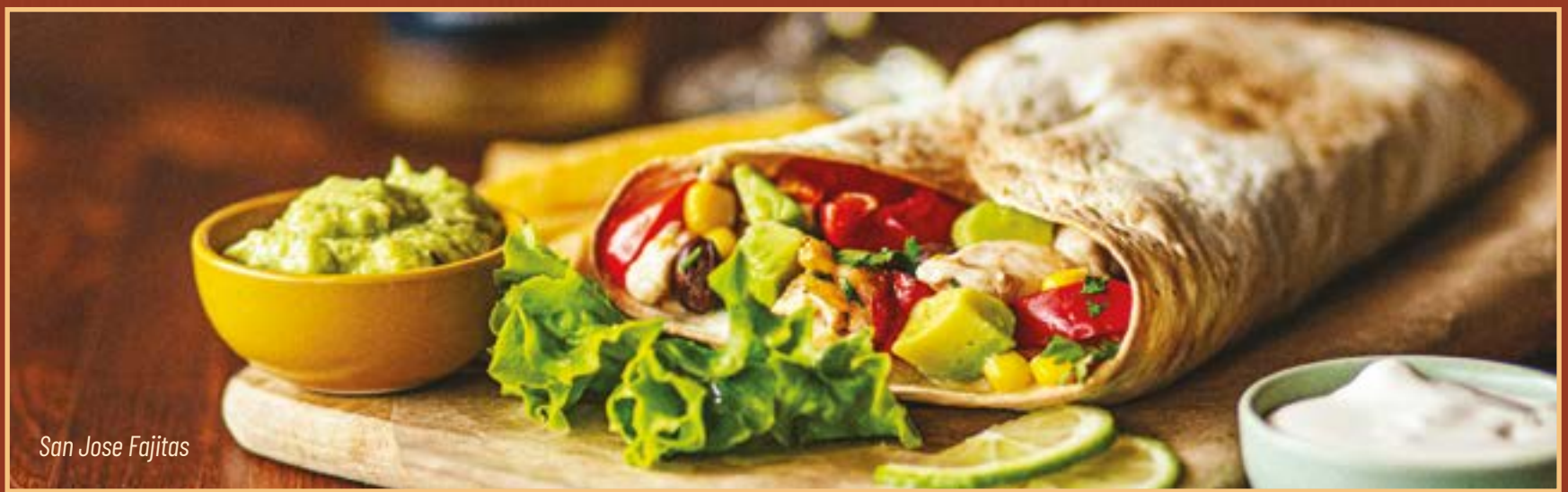
San Jose Fajitas

Served with our crispy Premium Fries and signature Old Wild West sauce