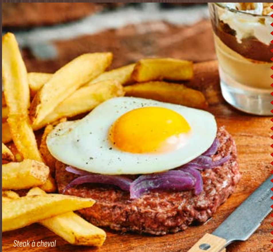
Steak à cheval

From midday to 3 PM, Monday through Friday. *See set menu