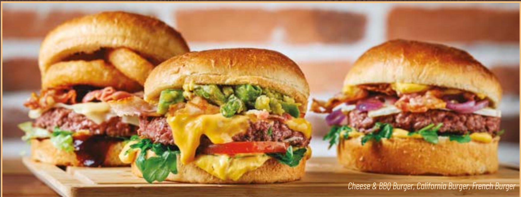
Cheese & BBQ Burger, California Burger, French Burger