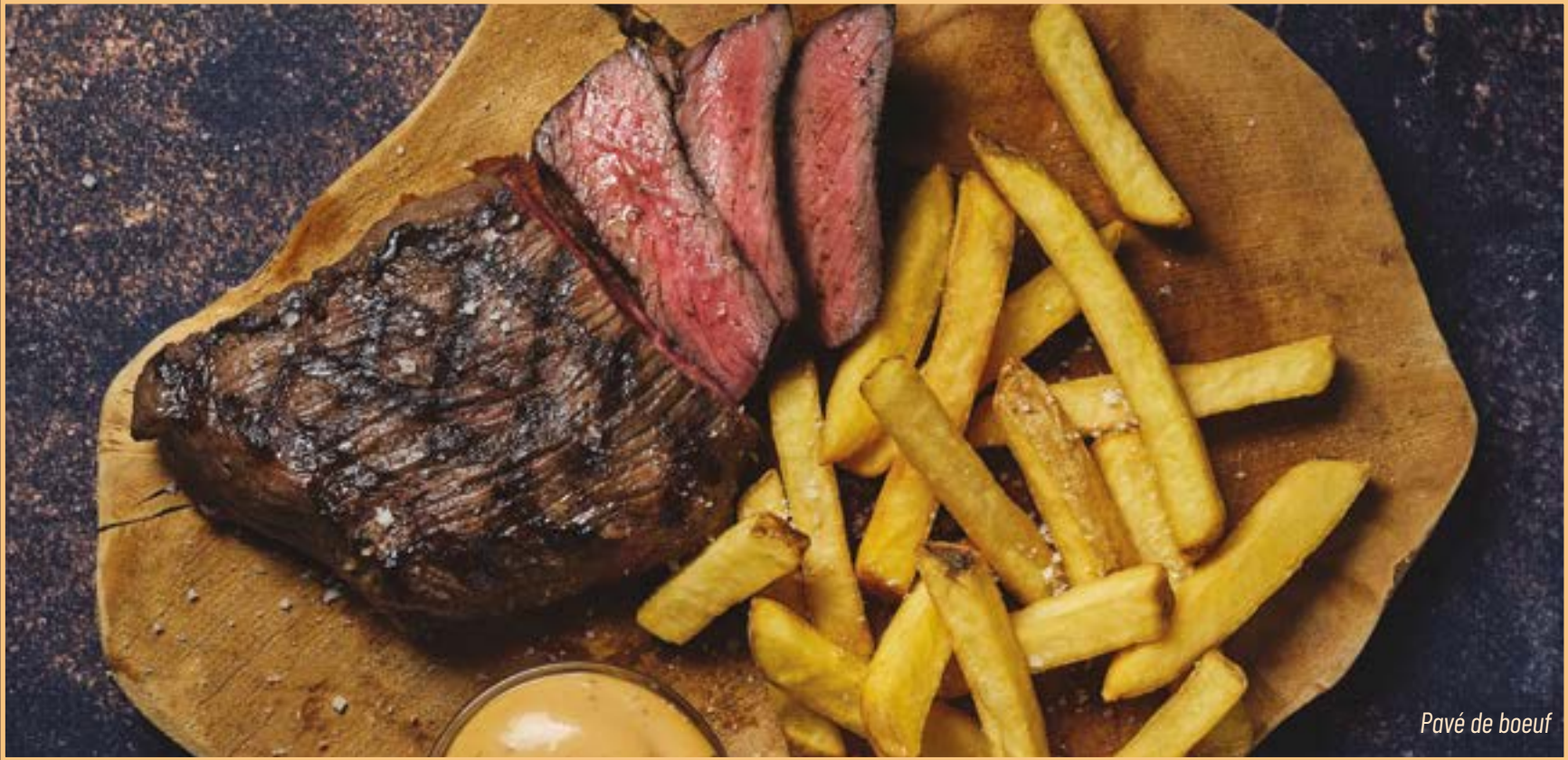
Pavé de boeuf

All of our meat dishes are served with our crispy Premium Fries.