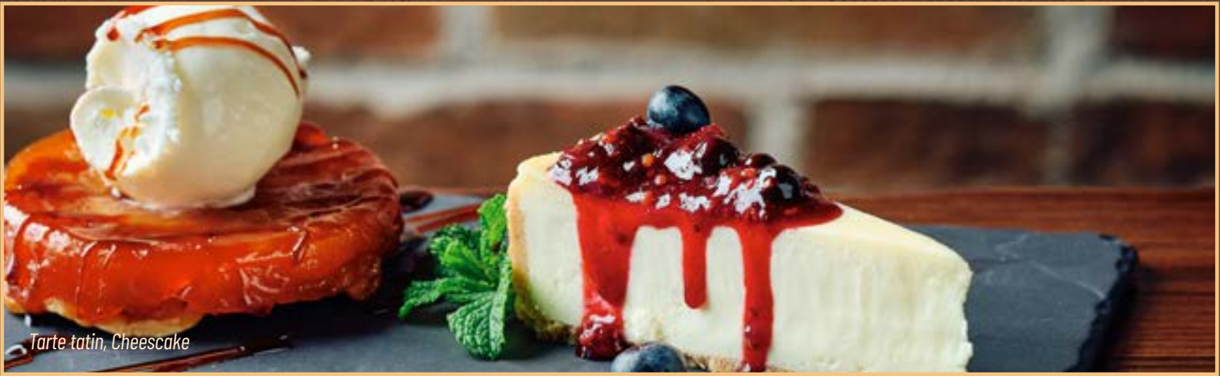
Tarte tatin, Cheesecake