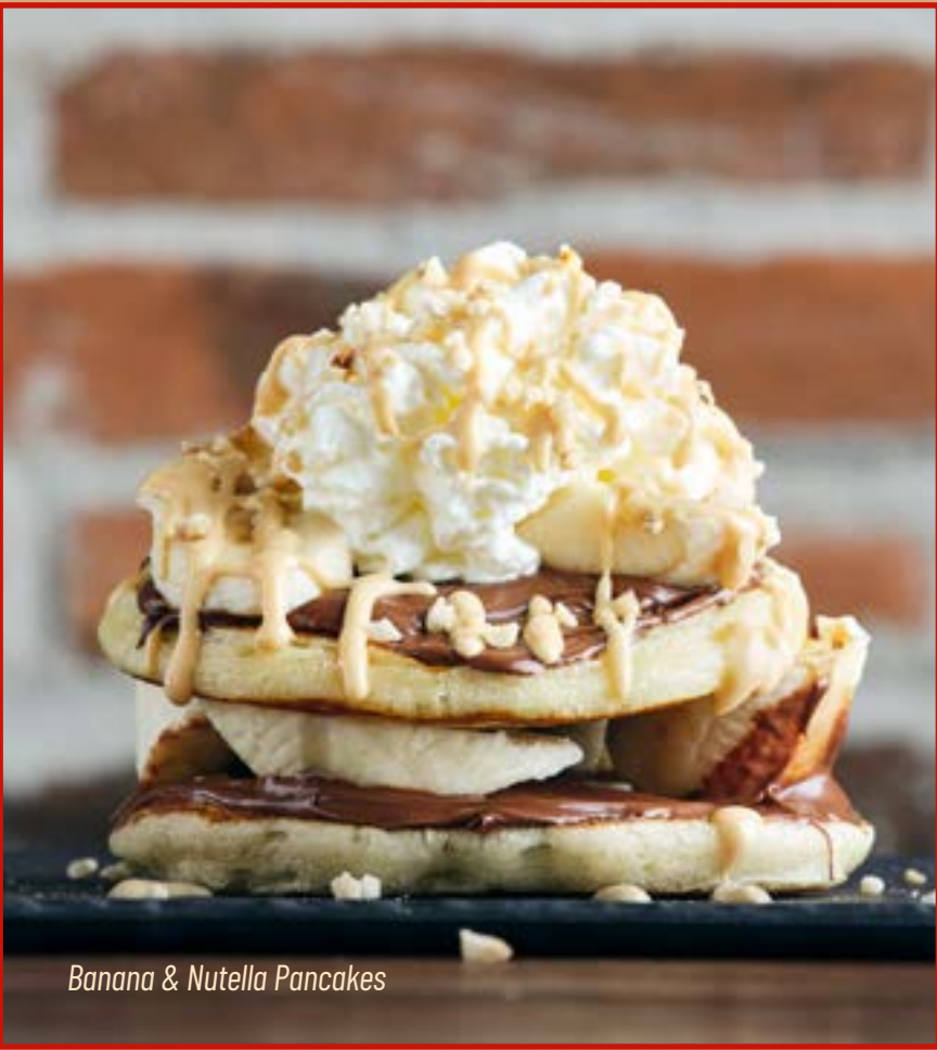
Banana & Nutella Pancakes