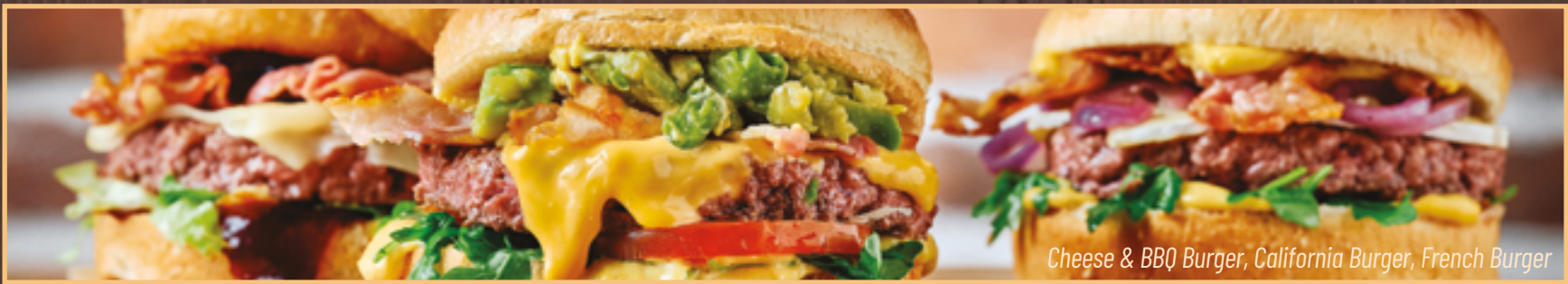
Cheese & BBQ Burger, California Burger, French Burger