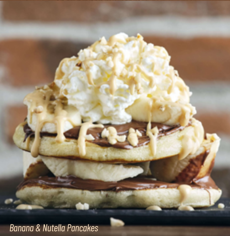
Banana & Nutella Pancakes