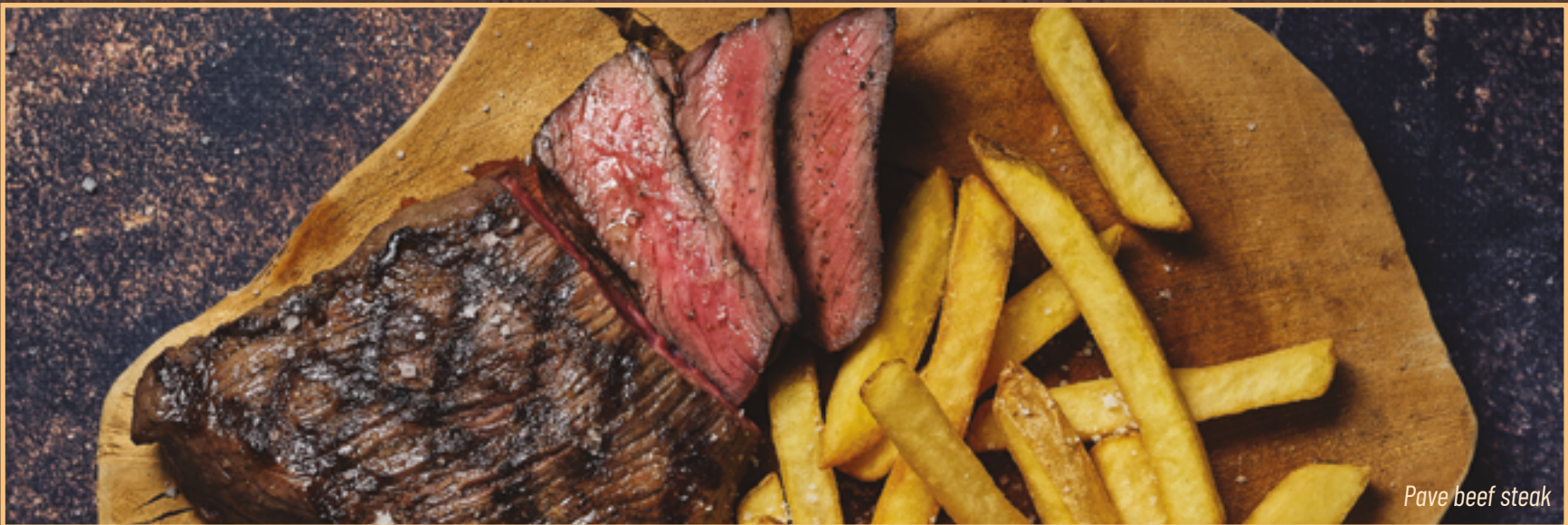
Pave beef steak

All of our meat dishes are served with our crispy Premium Fries.