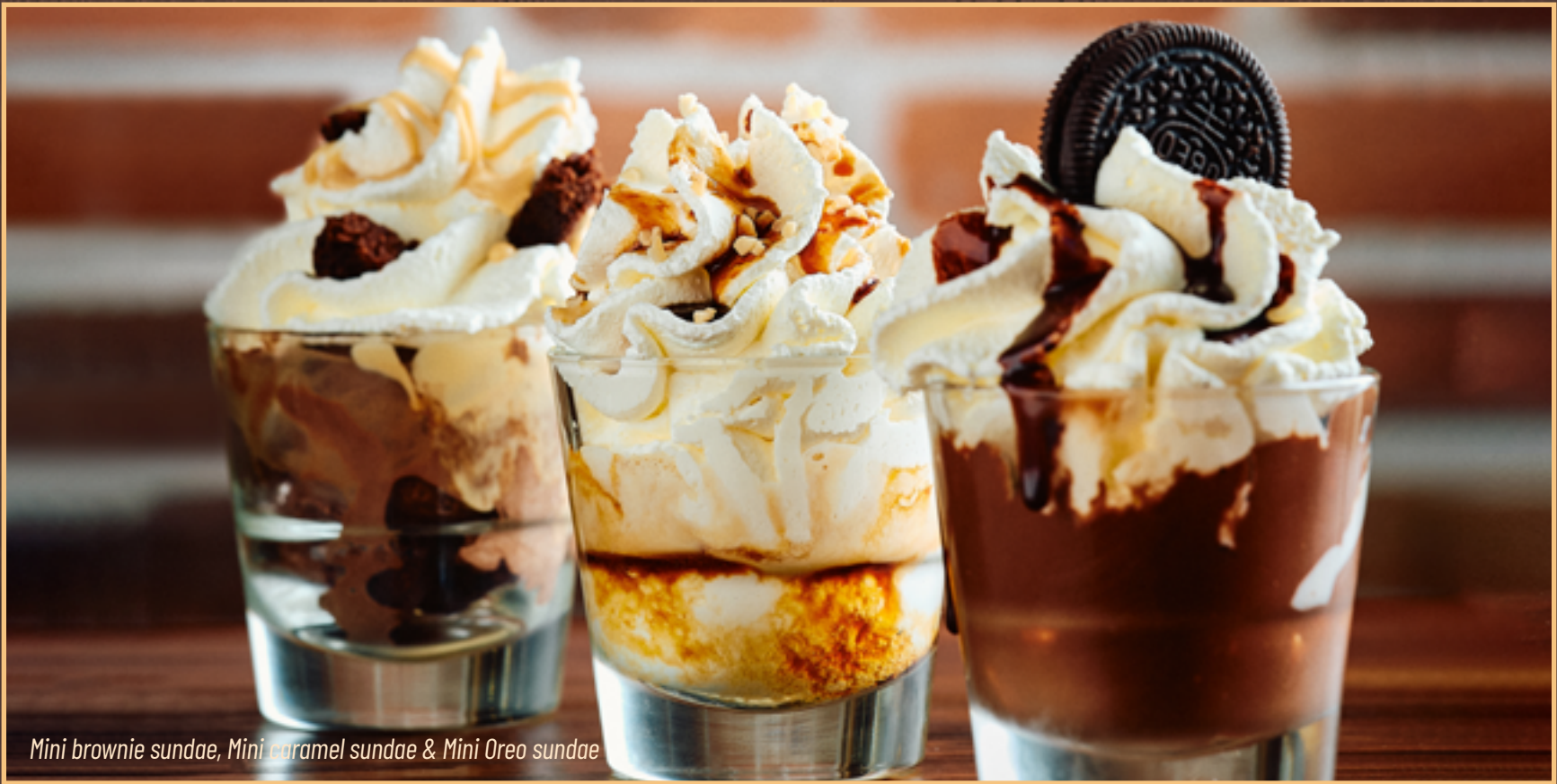
Mini brownie sundae, Mini caramel sundae & Mini Oreo sundae