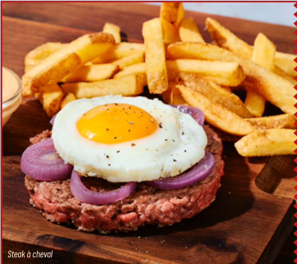
Steak à cheval

From midday to 3 PM, Monday through Friday. * See set menu