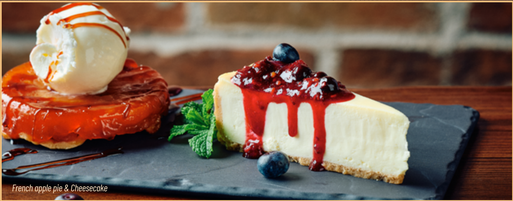
French apple pie & Cheesecake